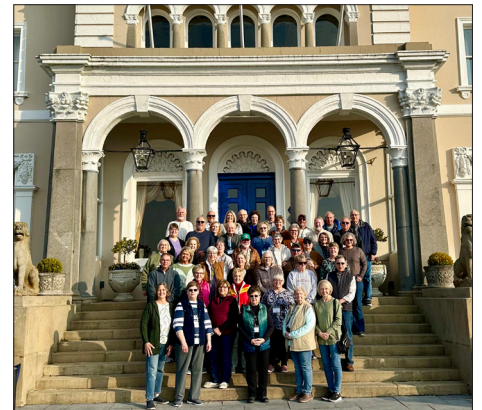
Horizons Club travelers on the steps of the Manor House Hotel, Enniskillen.

We headed home with memories of the trip of a lifetime! We hope you will join us on one of our upcoming journeys!