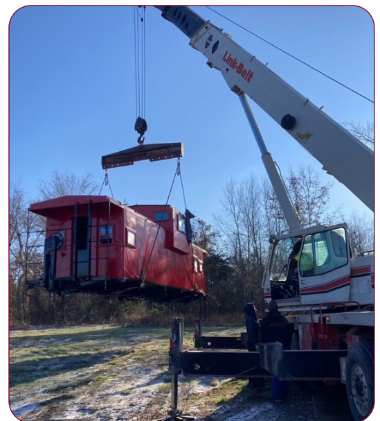
A crane moves the 1958 caboose to its new home outside of Fredericktown, MO.