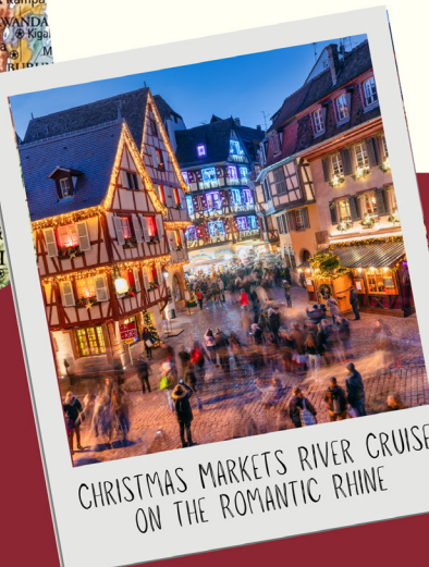
CHRISTMAS MARKETS RIVER CRUISE ON THE ROMANTIC RHINE